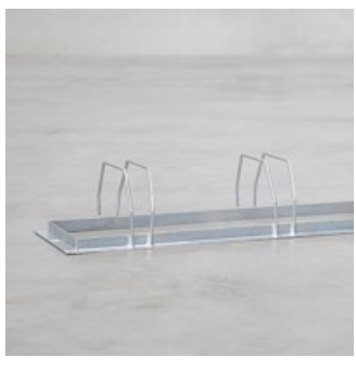
BIKE RACK GROUND Bike-Up Street

Bikerack for 4-5 bikes placed on the ground. The bikerack fits both small and big bikes parked in the same level.