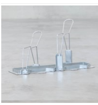
BIKE RACK GROUND