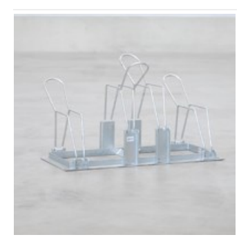
BIKE RACK GROUND